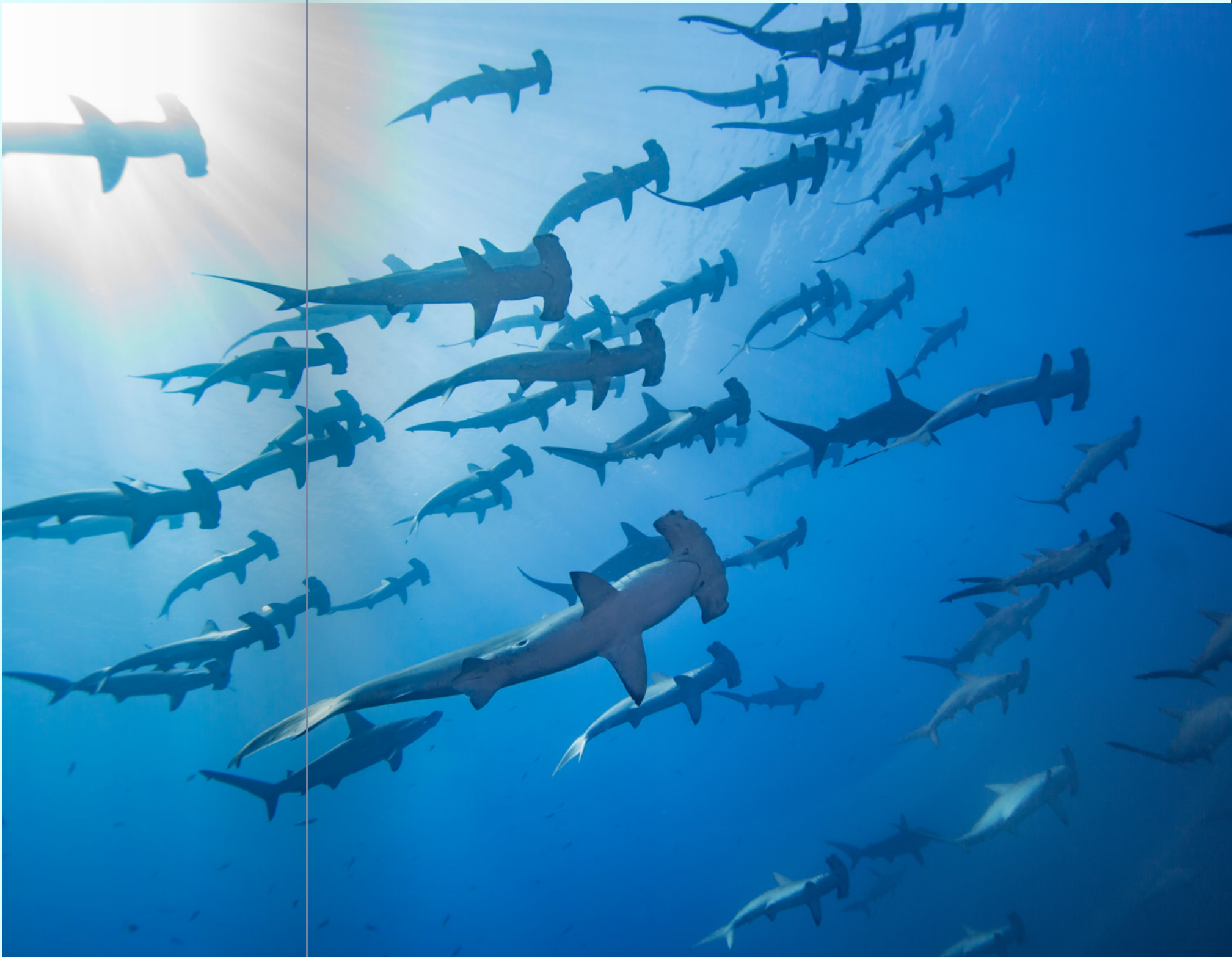
A strong population of top predators represent a healthy ocean

This month, we invite you to dive into pioneering research on the climate impacts of trawling, a new campaign to protect the biggest fish in the ocean and a celebration of some oyster-ly great news for one of our rewilding projects. We hope you enjoy it and thank you for your continued support of our work.