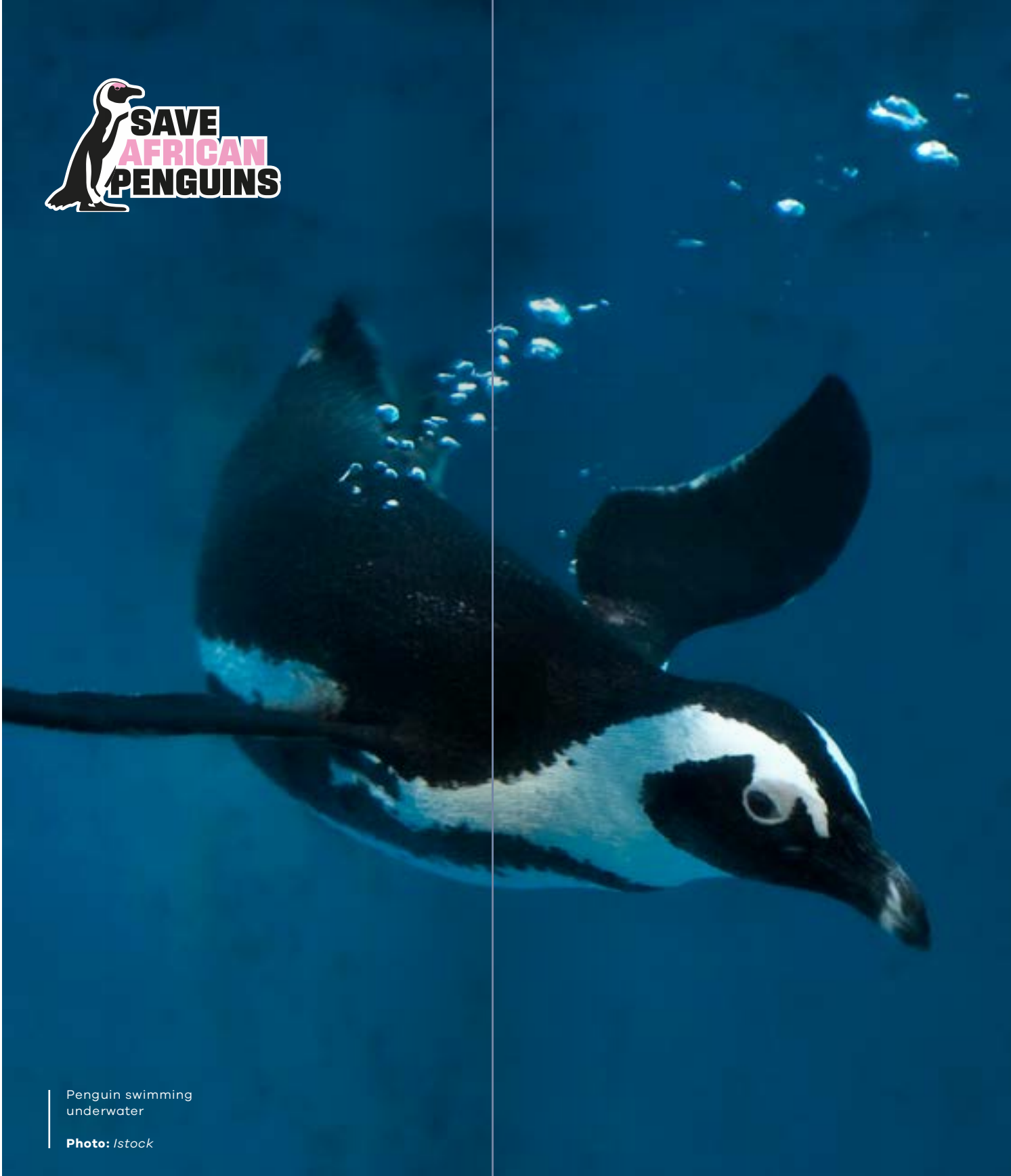
Penguin swimming underwater