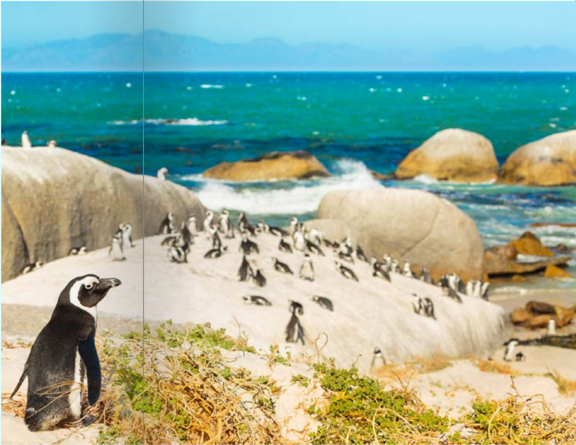
Within the next ten years, the African Penguin could be extinct.

This success only makes us more ambitious and aware of the power that lies in people's hands.